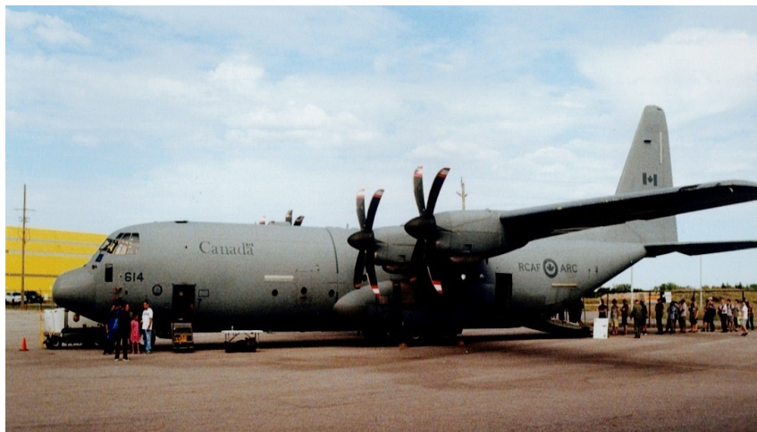
Air Force Day attendees on Aug, 13, 2022 toured RCAF CC-130 Hercules #130614 at CWHM

Beautiful weather helped to ensure the success of this year's Air Force Day at the Canadian Warplane Heritage Museum on August 13. Museum officials were delighted with record attendance.