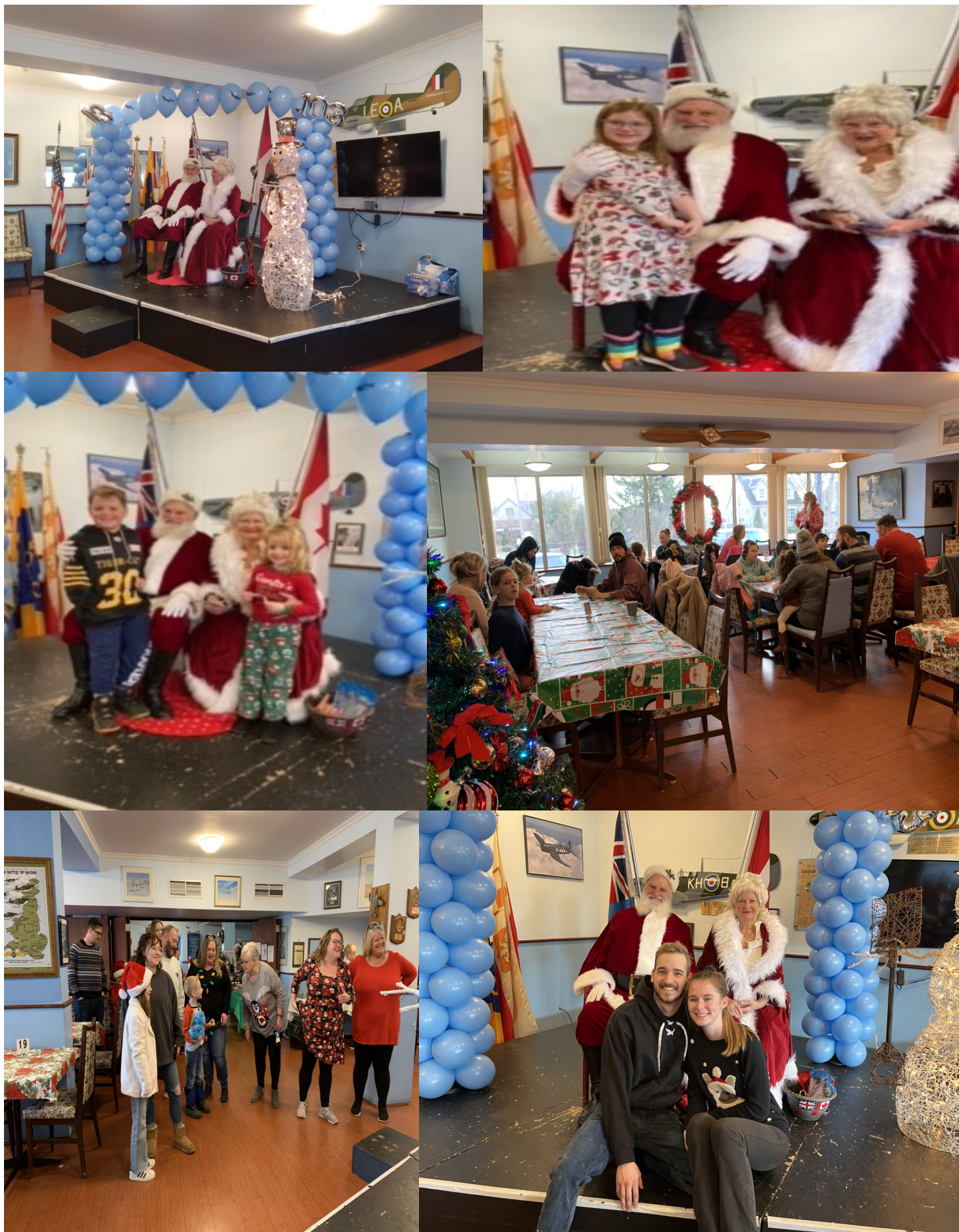
447 Wing Breakfast with Santa was held on December 10, 2022.