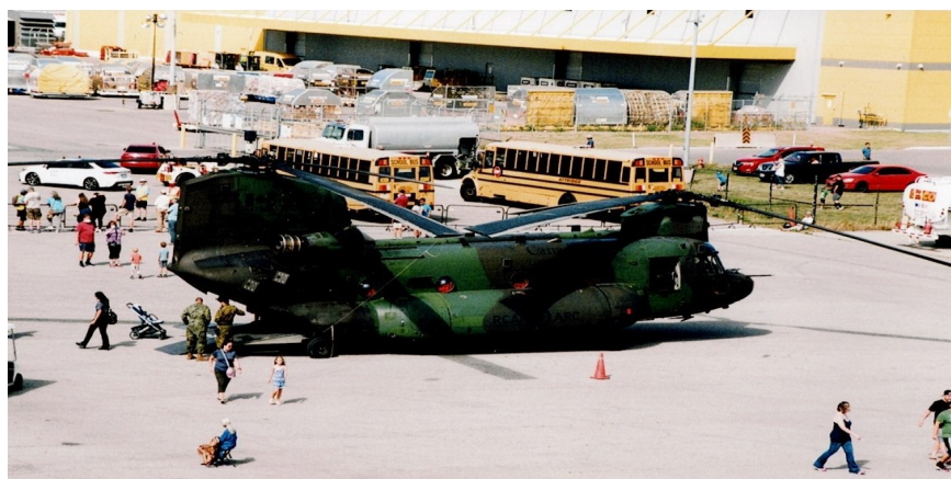
RCAF CH-147F Chinook. 147305, viewed from the observation deck at CWHM on Air Force Day 2022.