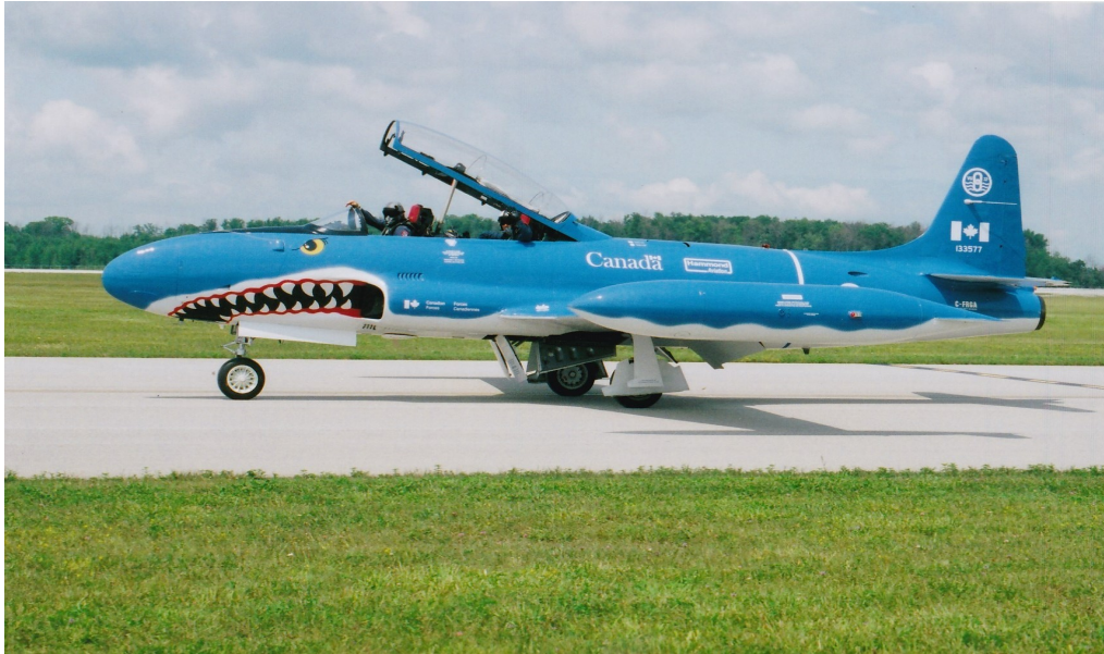
Waterloo Warbirds attractive "Mako Shark" Canadair CT-133 in 1992 retirement colours of RCN VU32 Sqdn.