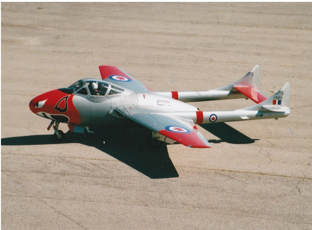
Waterloo Warbirds D.H. 115 Vampire Mk 55 C-FJRH in RCAF at CWHM Air Force Day, July 7, 2018