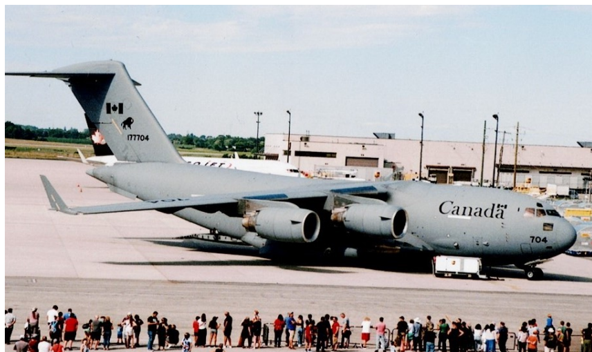
RCAF CC-177 Globemaster III, 177704, was among highlights of Air Force Day at CWHM Aug.13, 2022

Strong representation by the RCAF included a CC-177 Globemaster III, a CH-147F Chinook and a CC-130H Hercules. Visitors enjoyed a chance to tour inside the aircraft and meet the crews.