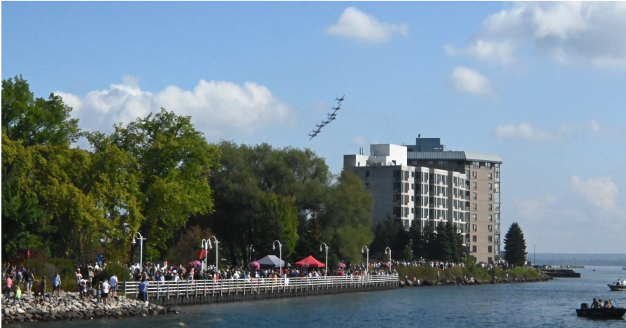
The Snowbirds approaching the Sault Ste Marie waterfront