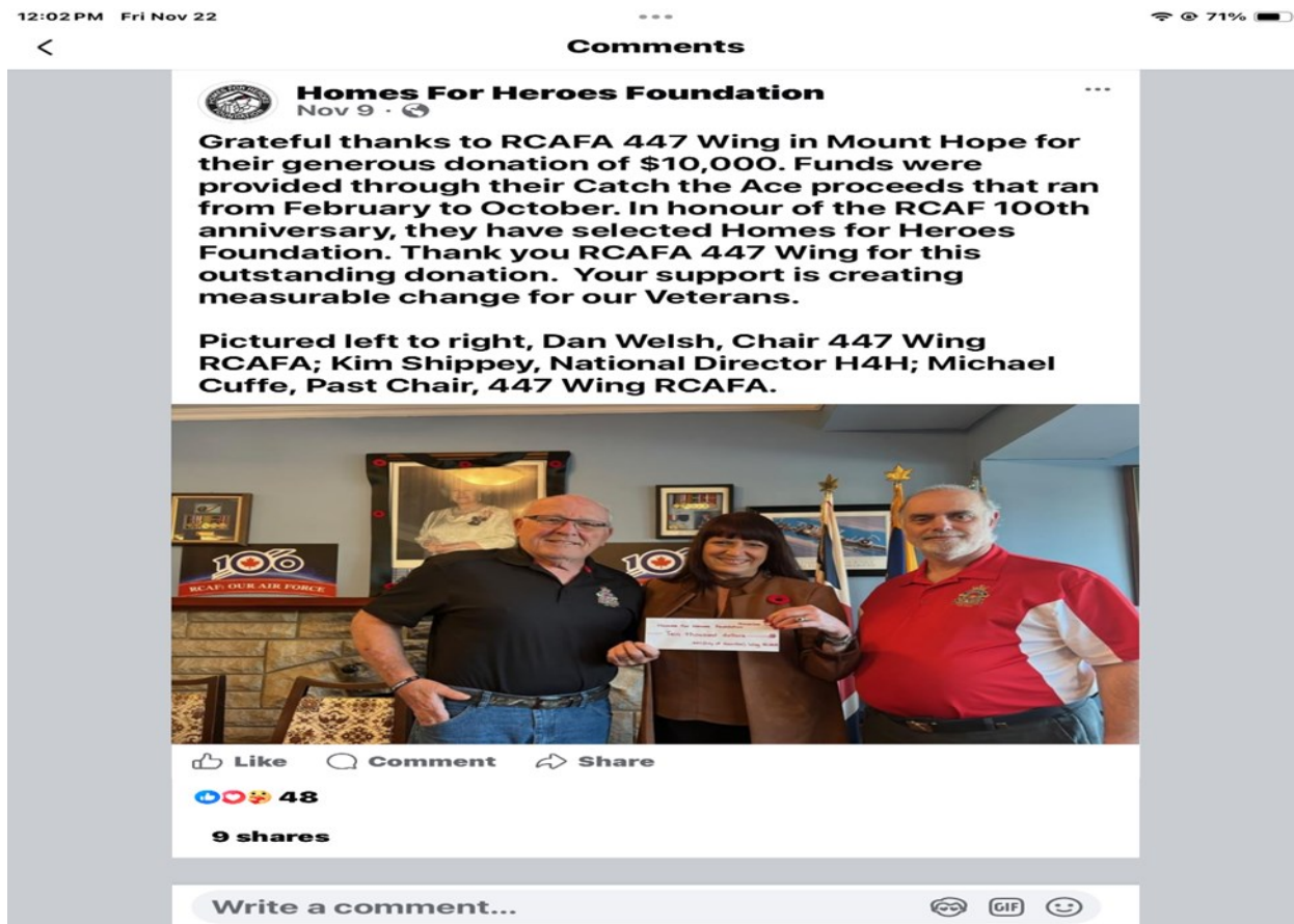
Homes for Heroes shared the above photo and information on their web page.

Below is Homes for Heros Notes on their news platform on the received donation