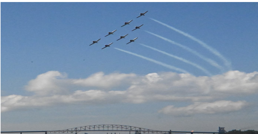
The Snowbirds flew over the International Bridge as they approached the Sault Ste. Marie waterfront.