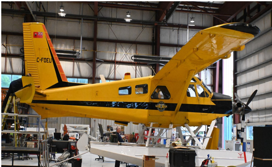
A Turbo Beaver undergoes heavy maintenance at the MNR hangar in Sault Ste. Marie on Sept. 20 2024.

The MNR fleet includes nine Bombardier Canadair CL-415 water bombers, along with Twin Otters, a Turbo Beaver and helicopters. An MNR staffer stated the agile 415s typically fly four-hour missions. They can drop 30 to 40 loads of water on a serious fire. "Our record was 102 loads in six hours."