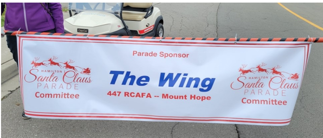
The Parade Banner on The Santa Claus Parade Day Good publicity for our organization.