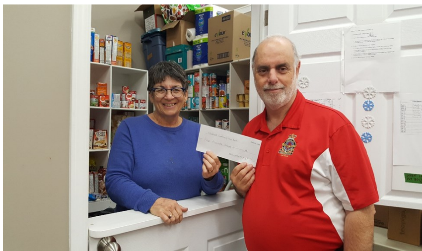
Presentation to Hamilton Food Bank $4,000.00