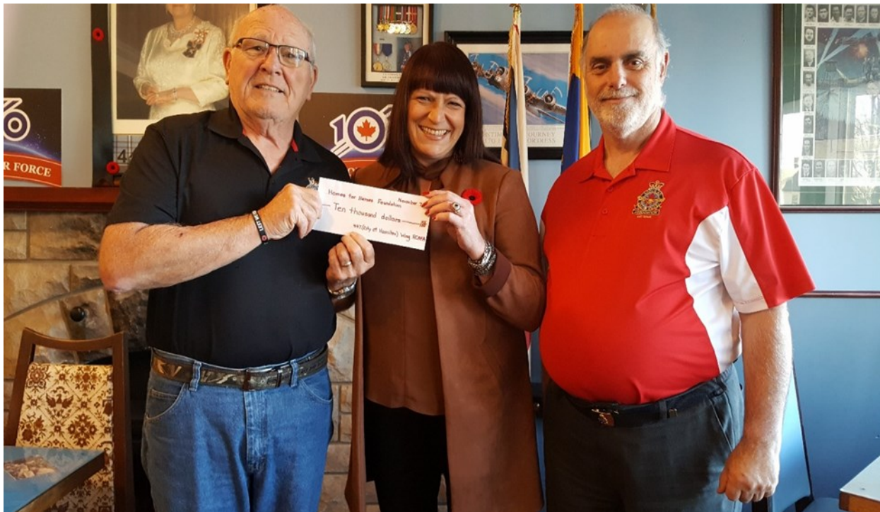
Presentation to Homes for Heroes $10,000.00 –veteran’s benefit from this money

Below is Homes for Heros Notes on their news platform on the received donation