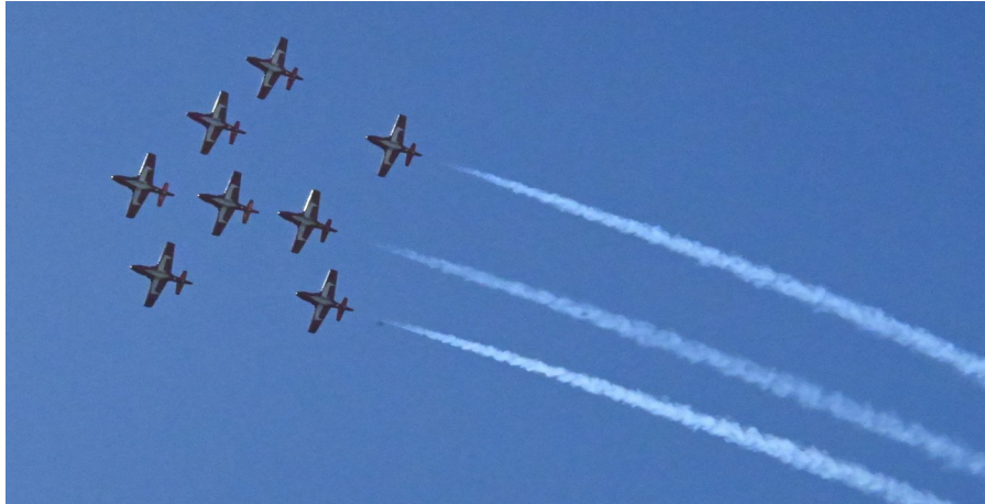
The Snowbirds flew an eight-plane display at Sault Ste. Marie