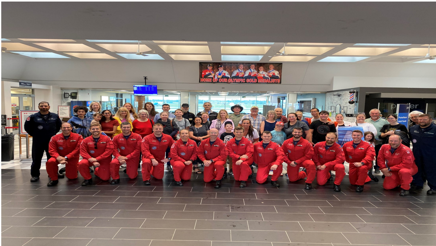
VIP Meet and Greet with Snowbirds

More details can be found on the CBHC Facebook page, well worth checking out.