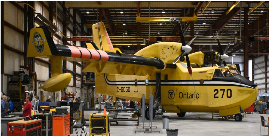
One of nine CL-415s in the MNR fleet, shown at the MNR hangar in Sault Ste. Marie.