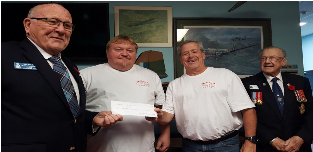
Presentation to Hamilton Christmas Parade Committee Members $4,000.00