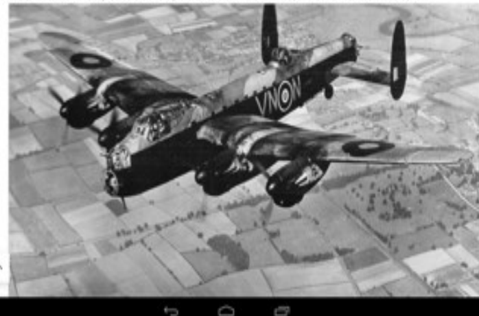
Avro Lancaster I (R5689 VN-N) on a mission to Frisian Islands on 1942-09-19