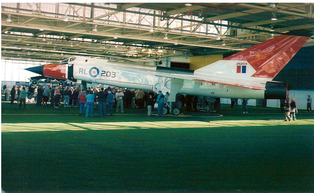
The Arrow as it was originally unveiled in Downsview in 2006 by the Toronto Aerospace Museum.