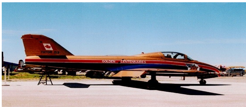
Old Gold CT-114 Tutor in Golden Centennaires colours on static display at the 2022 Borden Air Show

Static displays included a RCAF CH-147F Chinook, a Tutor in Golden Centennaires colours, and the resplendent Beech Expeditor 3NM in “Canadian Queen” markings among other aircraft. The twin Beech, (s/n 1552/C-FTLU) served in the RCAF from 1952 until 1967 when it went to multiple owners in the U.S. Dave Hewitt of Woodstock, ON acquired the aircraft from a museum in Arkansas and repatriated it to Canada in 2015.