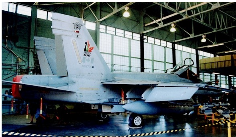
RCAF CF-18 Hornet 188707 with “Borden 100” tail fin logo was a featured hangar display at the CFB Borden Air Show