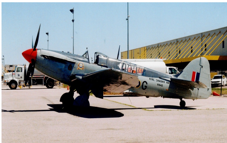
The prized Fairey Firefly of the Canadian Warplane Heritage Museum at Skyfest 50 on 25 June.

The CWHM Fairey Firefly, returning to the skies after an eight-year hiatus for repair, attracted considerable attention. It was rewarding to see this impressive aircraft, powered by a 2,245 hp Rolls-Royce Griffon, back in action again.