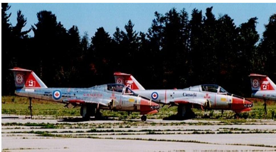
Static Tutors at CFB Borden illustrate different schemes on the CT-114 during its service as the RCAF basic jet trainer.