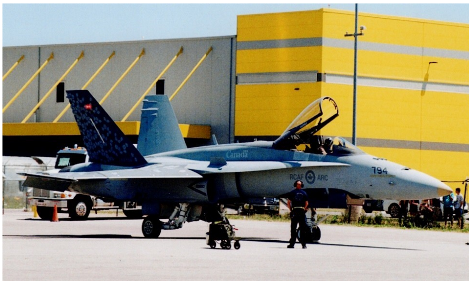
The RCAF CF-18 Demo Hornet at Skyfest 50 in a scheme combining operational grey with a geometric pattern on the wings and tail fins.

The RCAF CF-18 Hornet Demo, in its two-tone grey colour scheme for 2022, took centre stage. The RCAF also contributed a CT-156 Harvard II. Hannu Halminen flew his striking P-51D Mustang in the colours of 424 Auxiliary Squadron as flown at Mount Hope in the 1950s.