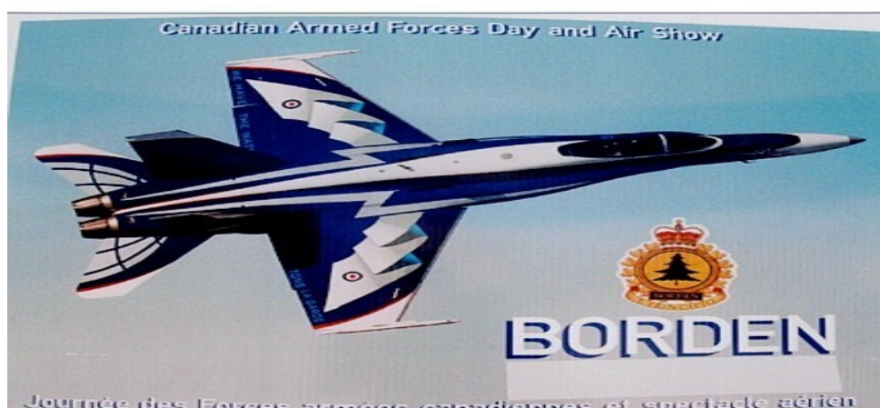
Poster for the 2022 CFB Borden Air Show featured an image of the 2018 Demonstration Hornet

Base Borden provided attendees with a complimentary 46-page program that featured a tribute to the RCAF CF-18 Hornet Demo Teams, from the first appearance in 1993 to 2022. An illustrated three-page section, providing a comparison of the various paint schemes created each year, was especially appreciated. The 2009 finish, highlighting the colour gold as its base to ‘fit’ with the Golden Centennaires and the Golden Hawks, celebrated the 100 th anniversary of powered flight in Canada and ranks as a personal favourite.