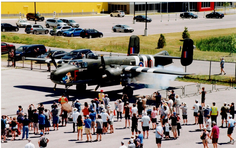
Skyfest 50 attendees watch the CWHM B-25 Mitchell firing up.

The CWHM B-25 Mitchell and other CWHM vintage aircraft were also crowd-pleasers, as the museum's Lancaster was on static display pending the replacement of its No. 1 engine.