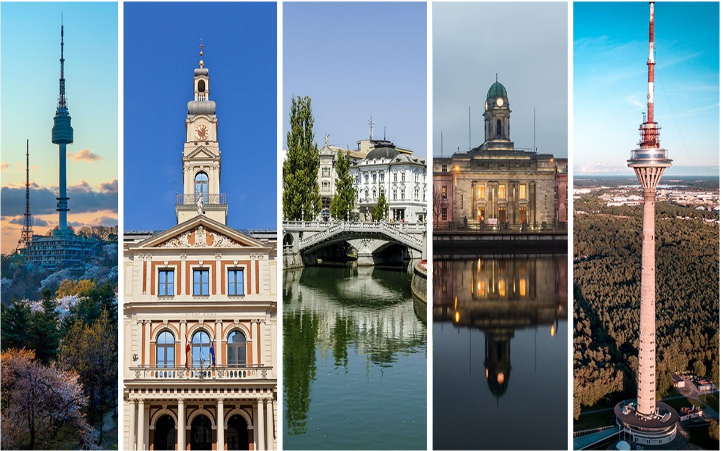
Above images: Locations around the world to be blue on April 1, 2024. Left to right, N Seoul Tower in South Korea, Riga Town Hall in Latvia. Tromostovje Bridge in Ljubljana, Slovenia, Cork City Hall in Ireland, Tallinn TV Tower, Estonia.