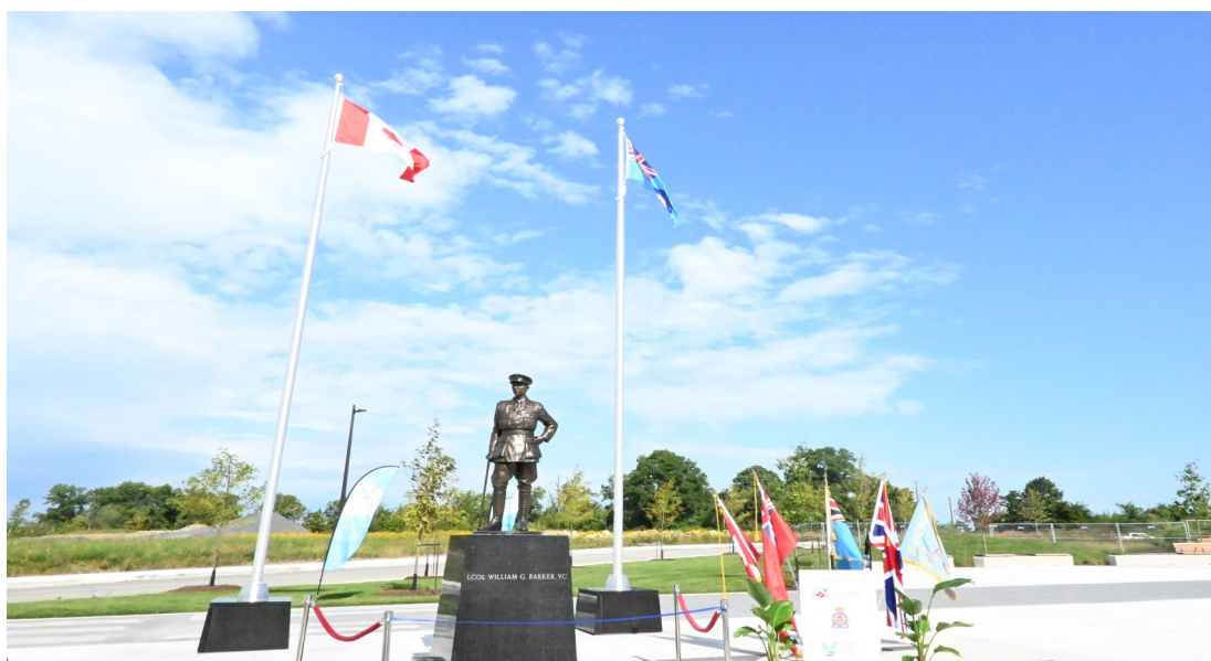
Sunshine prevailed at the Grand Opening.