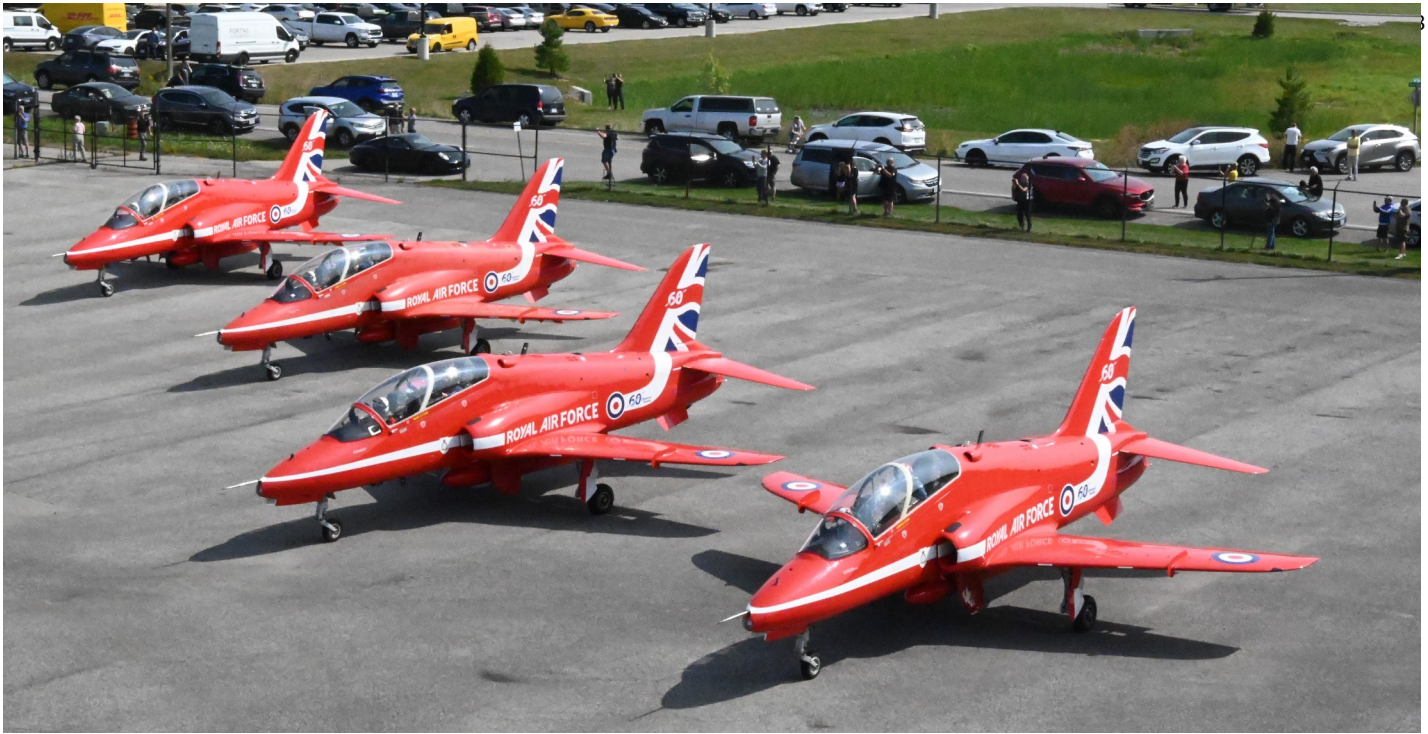
Four Hawk trainers of the Red Arrows at CWHM Sept. 11 2024 (1)