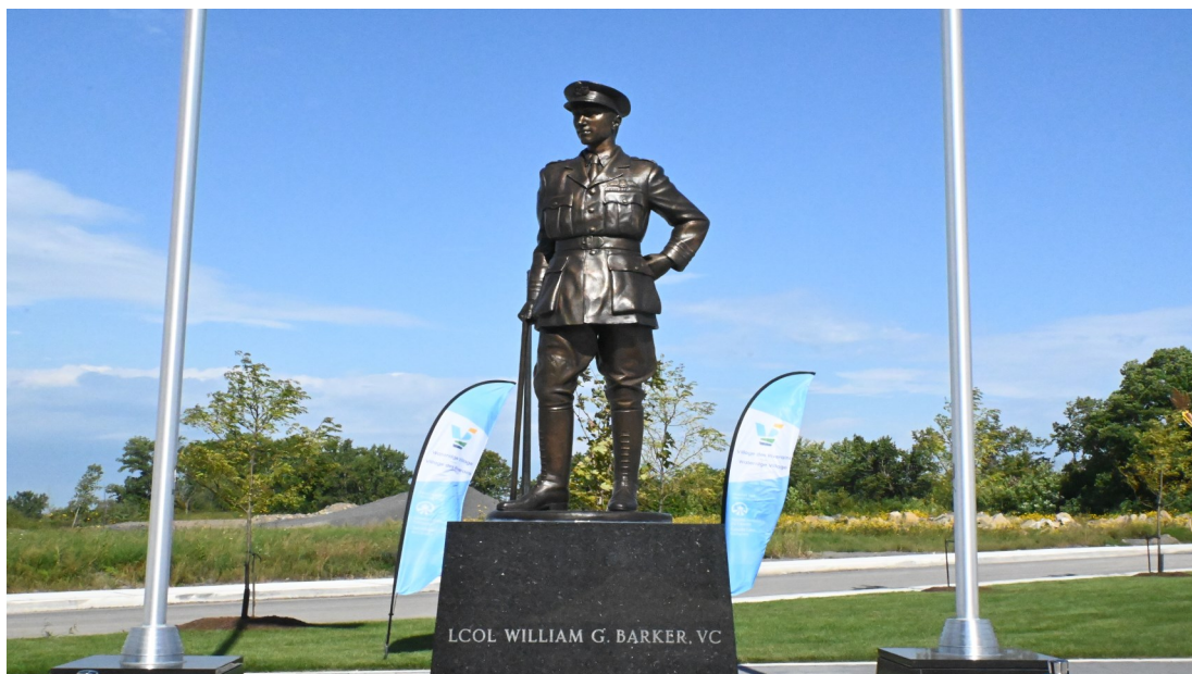
LCol William G. Barker, VC Park unveiled at original Rockcliffe site Sept. 6, 2024