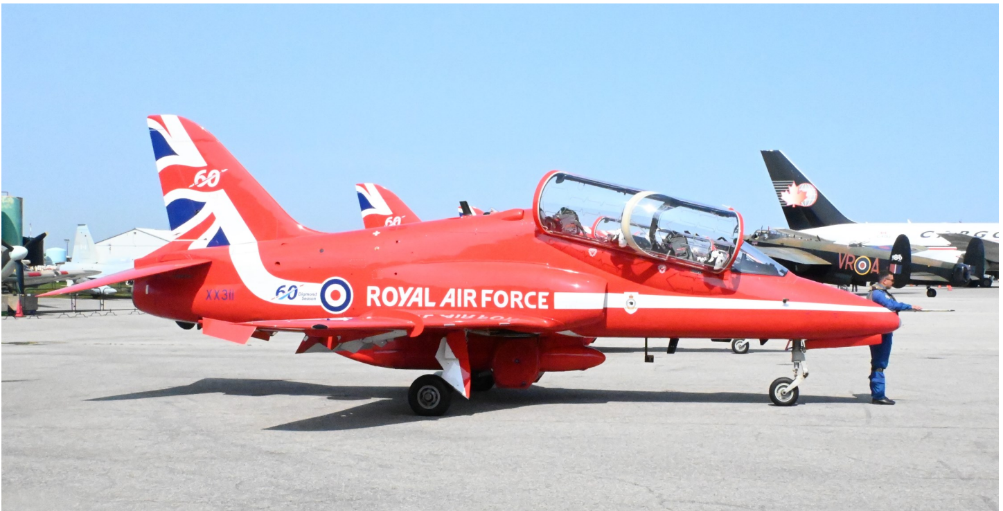
A Red Arrows pilot prepares with his Hawk trainer before the team departs the museum.