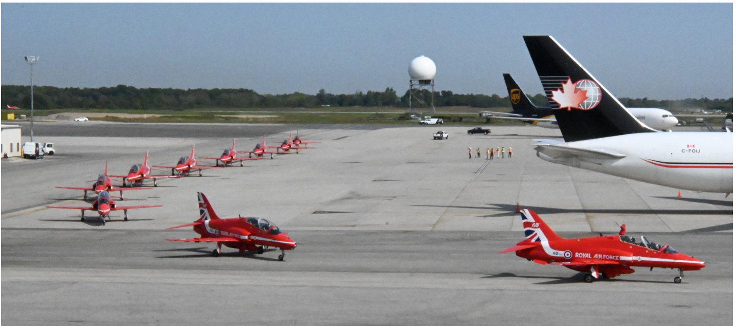
The Red Arrows arriving at CWHM Sept 11 2024

CWHM staff, volunteers and members were thrilled with a day that delighted everyone in attendance